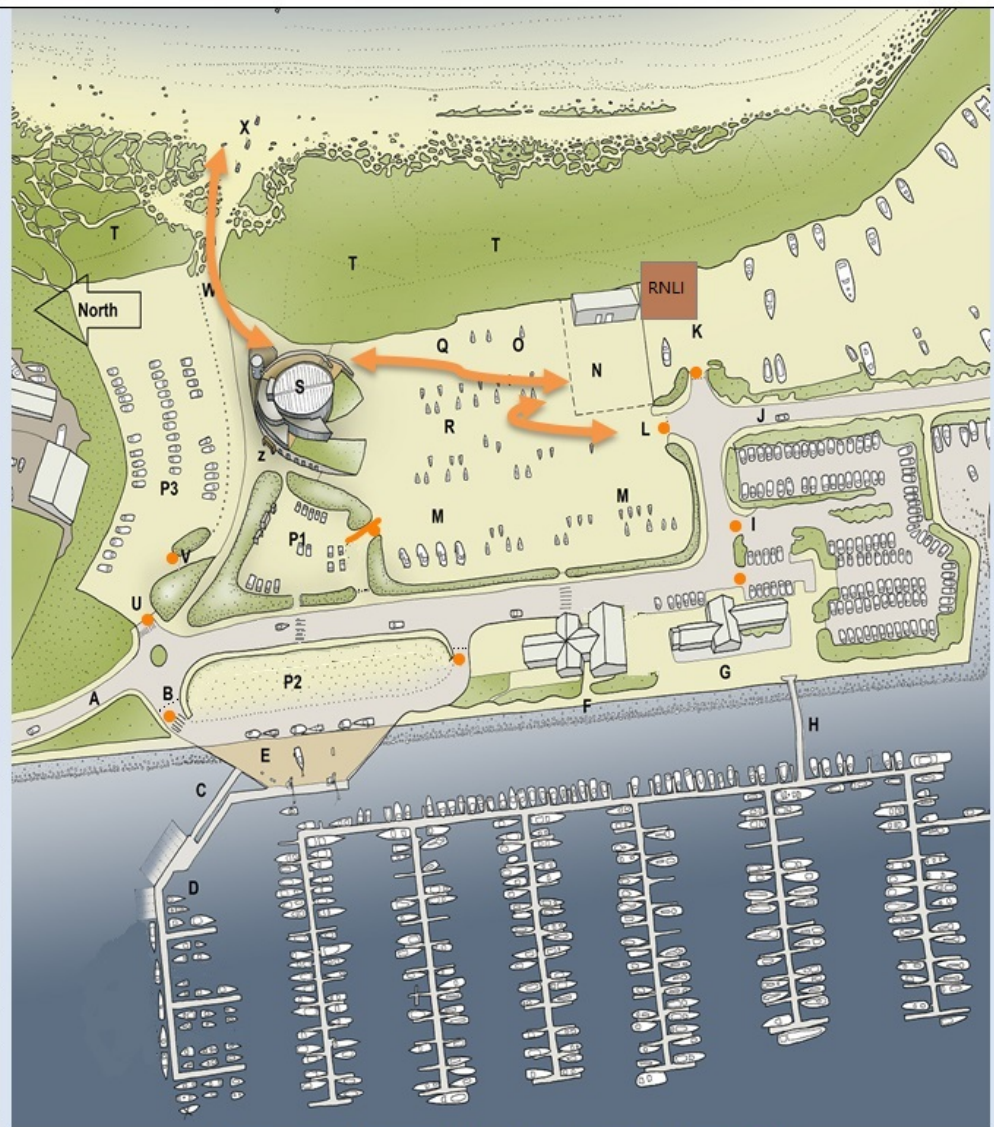
Areas on and around the Academy and Events Site